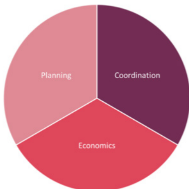
San Francisco Region Top Themes