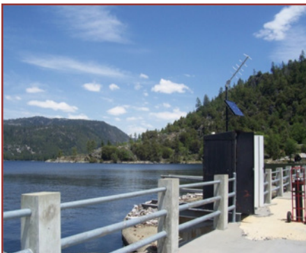
Hetch Hetchy Reservoir

The City of San Francisco, for instance, receives its water from the historically controversial Hetch Hetchy system piped in from 167 miles away in the Sierra Nevada mountains.